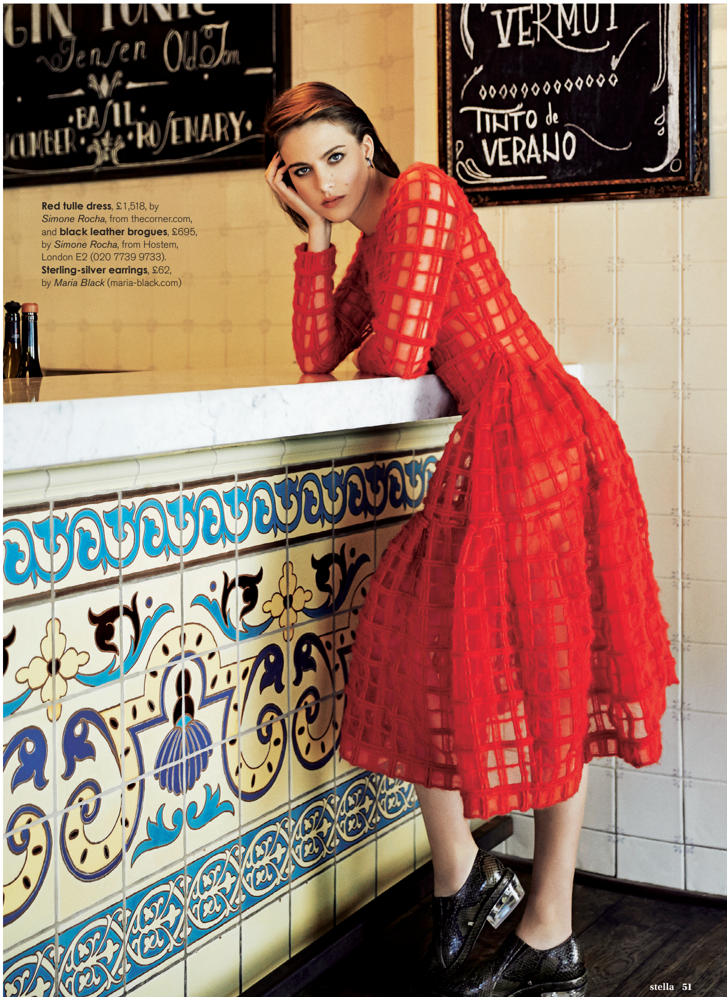
Red tulle dress , £1,518, by Simone Rocha , from thecorner.com , and black leather brogues , £695, by Simone Rocha , from Hostem, London E2 (020 7739 9733). Sterling-silver earrings , £62, by Maria Black ( maria-black.com )