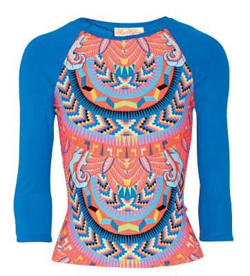
Blue and orange print, £145, by Mara Hoffman, from net-a-porter.com