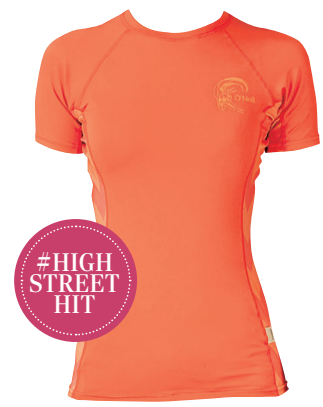
Coral short-sleeve, £24.99, by O'Neill, from surfdome.com