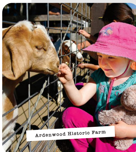
Ardenwood Historic Farm

See what life was like at the turn of the last century at this preserved and fully functioning family farm. There's a Victorian farmhouse, formal gardens, a blacksmith shop, a hay barn, and a farmyard. Learn how to harvest hay, make rope, and more. ebparks.org .