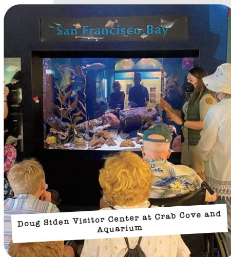
Doug Siden Visitor Center at Crab Cove and Aquarium