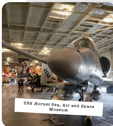
USS Hornet Sea, Air and Space Museum

On this aircraft carrier that served from 1943 to 1970, kids will learn how an airplane can take off from a ship with only a few hundred feet of runway. They'll see more than 15 historic aircraft and exhibits highlighting World War II's Battle of Midway and the recovery of the Apollo 11 and 12 capsules. uss-hornet.org .