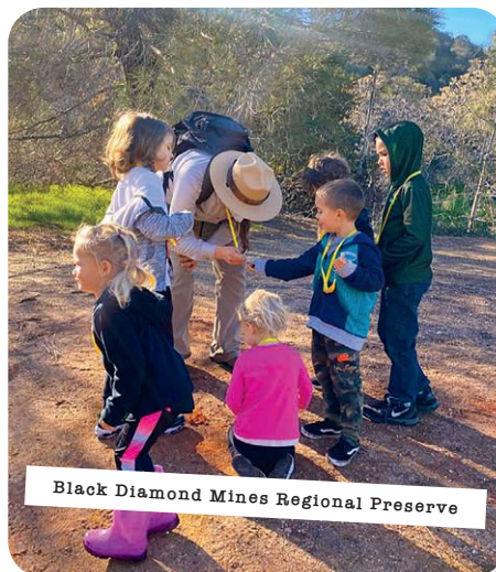
Black Diamond Mines Regional Preserve

Walk in the footsteps of environmentalist John Muir, who cofounded the Sierra Club and whose activism earned him the nickname "Father of the National Parks." Take a tour of Muir's home, the 17-room Victorian mansion built in 1882 by his father-in-law, and wander through the oak and grasslands of Mount Wanda, where Muir hiked with his daughters. nps.gov/jomu .