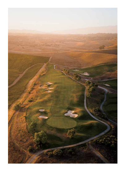
OPPOSITE: HIKE ALONG THE EAST SHORE TRAIL IN LIVERMORE'S DEL VALLE REGIONAL PARK. THIS PAGE, FROM LEFT: THE LIVERMORE FARMERS MARKET HAPPENS TWICE A WEEK AND HAS VARIOUS LOCAL ITEMS, SUCH AS FRESH PRODUCE AND DESSERTS; POPPY RIDGE GOLF COURSE FEATURES 27 HOLES AND A BEAUTIFUL VIEW OF LIVERMORE VALLEY WINE COUNTRY.

Three courses within city limits give variety to golfers of all skill levels. Poppy Ridge named its three Rees Jones-designed nines after grape varietals: Merlot, Chardonnay, and Zinfandel. Each ends in front of the hacienda-style clubhouse, which serves champagne brunch at its restaurant every weekend. The 18-hole Course at Wente Vineyards, designed by golf great Greg Norman, is situated amid picturesque vineyards. It plays host to the Livermore Valley Wine Country Championship, part of golf's Nationwide Tour. Las Positas's 18-hole course and practice range are easy on the wallet and open to the public for play or lessons.