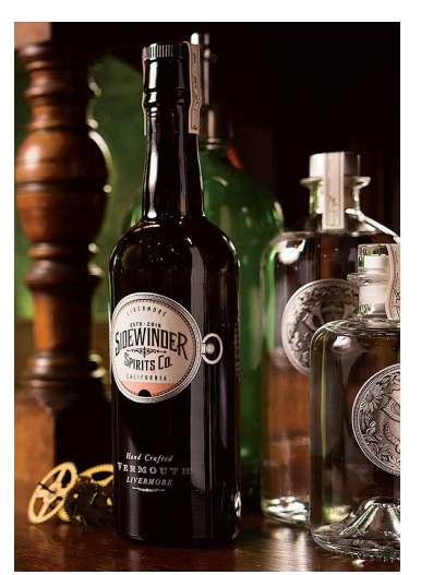
OPPOSITE: ENJOY SEASONAL DISHES AT RANGE LIFE, WHERE THE MENU CHANGES FREQUENTLY. THIS PAGE, FROM TOP: AT CONCANNON VINEYARD, VISITORS CAN INDULGE IN A VARIETY OF TASTING EXPERIENCES; SIDEWINDER SPIRITS CO. DISTILLERY OFFERS SPIRITS AND BOTTLED COCKTAILS TO GO.

Spirits, like wine, can evoke a sense of place, and this microdistillery that launched from Occasio Winery in 2016 uses Livermore wine as the base of its vermouth, grappa, and eau-de-vie de vin. It also makes gin and whiskey. sidewinderspiritsco.com.