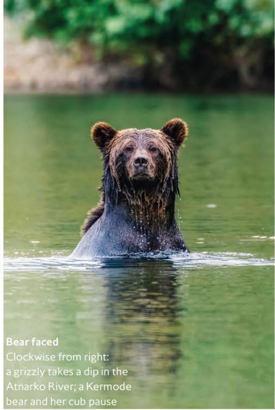
Bear faced Clockwise from right: a grizzly takes a dip in the Atnarko River; a Kermode bear and her cub pause from eating barnacles at Gribbell Island; Steller sea lions on rocks near Princess Royal Island