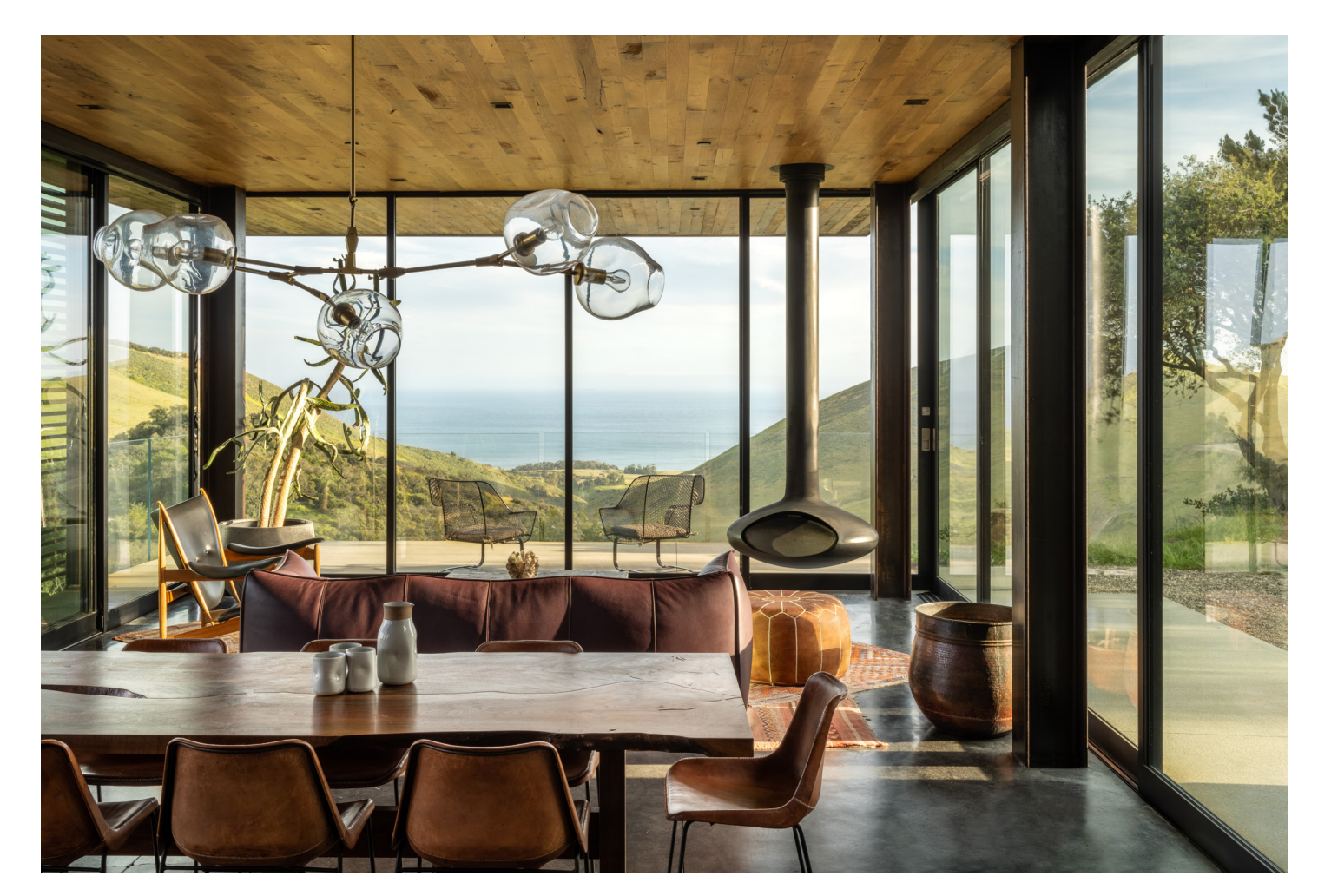
Views over the vast site, a working cattle ranch, are captured from three sides of the living space.