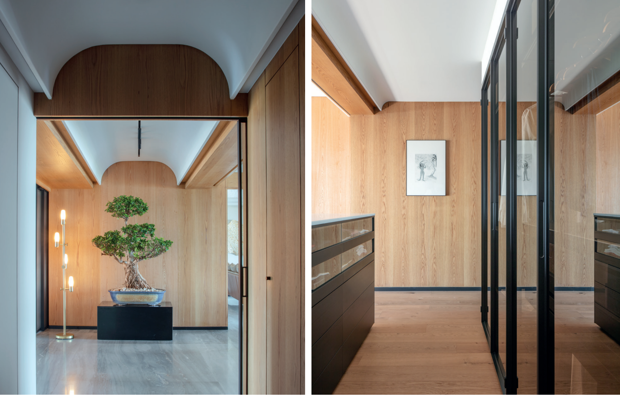
lined shell. The wardrobe is by Porro