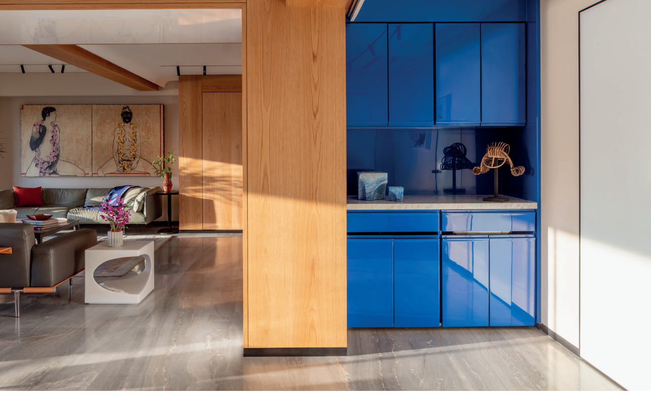
Several accents, including the candles in the foreground and the ribbed vase to the right are Rooshad's own design