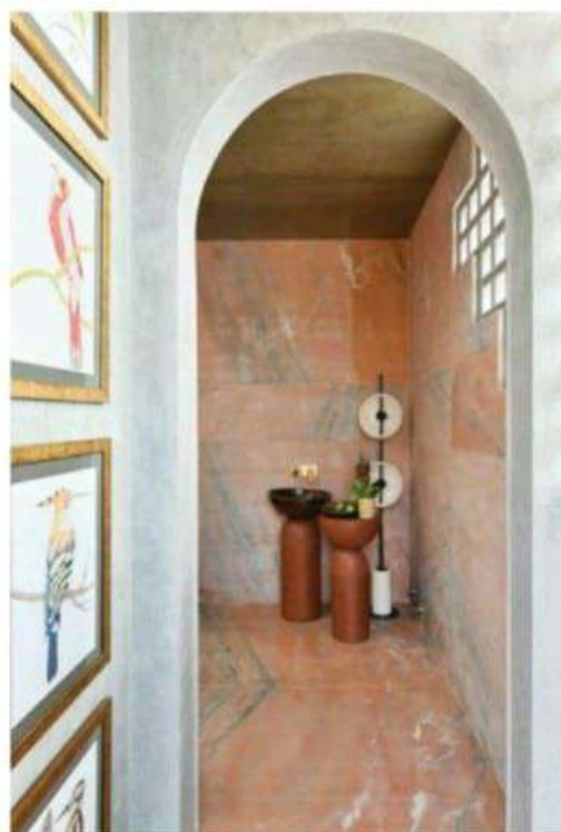
From top: Buttercup yellow flooring meets peachy pink walls in the amphitheatre; A small archway leads into a restroom defined by peachy-pink hues. The vanity is a custom design