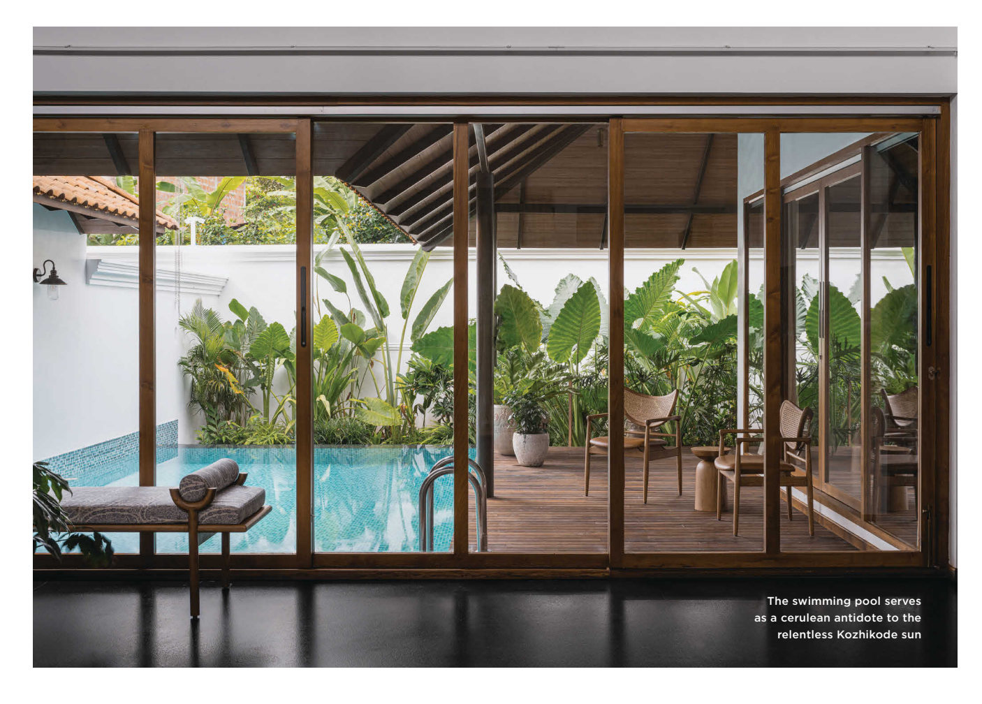
"The owners already had two homes but wanted this one to be different, with an open layout and traditional elements, and water bodies and greenery on either side of the threshold"