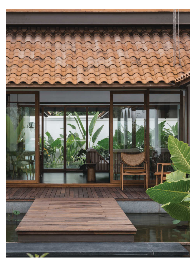
The design scheme seamlessly blends the inside with the outside

Most months, the water bodies brim with colour: soft whites, gentle greens, warm browns and pale blues, each individually embodied in the petals of a lily in bloom. But the flowers, like the seasons, are short-lived, budding, blossoming, withering, before assuming life all over again. In these moments, the ones between life and no life, earth and architecture, light and shadow, it's evident that the landscape and its elements are entwined. Indeed, this is a home that gives to the people and the place in equal spirit, no matter how long or short the season. ◆ Instagram: @aslamsham_architects