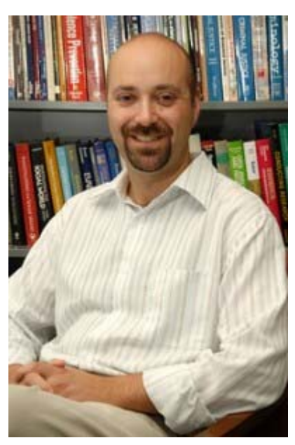
Author Aaron Kupchik says

Students acting up in class tends to be a big problem. A lot of the teachers told me that most of the time kids act up because they don't understand the material. So kids acts up and what do we do? We kick them out of class. So they lose instruction time and understand the material even less when they return. Kicking them out might help the