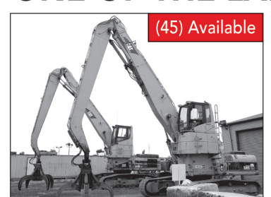
Material Handling Excavators with Grapples, Magnets and Shears