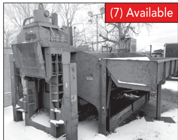
Sierra Shear Baler