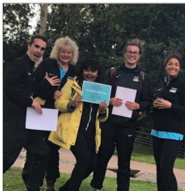
ORGANISERS: Hosts show off awards

A PROJECT aimed at increasing wellness and employability has relaunched in Burngreave.