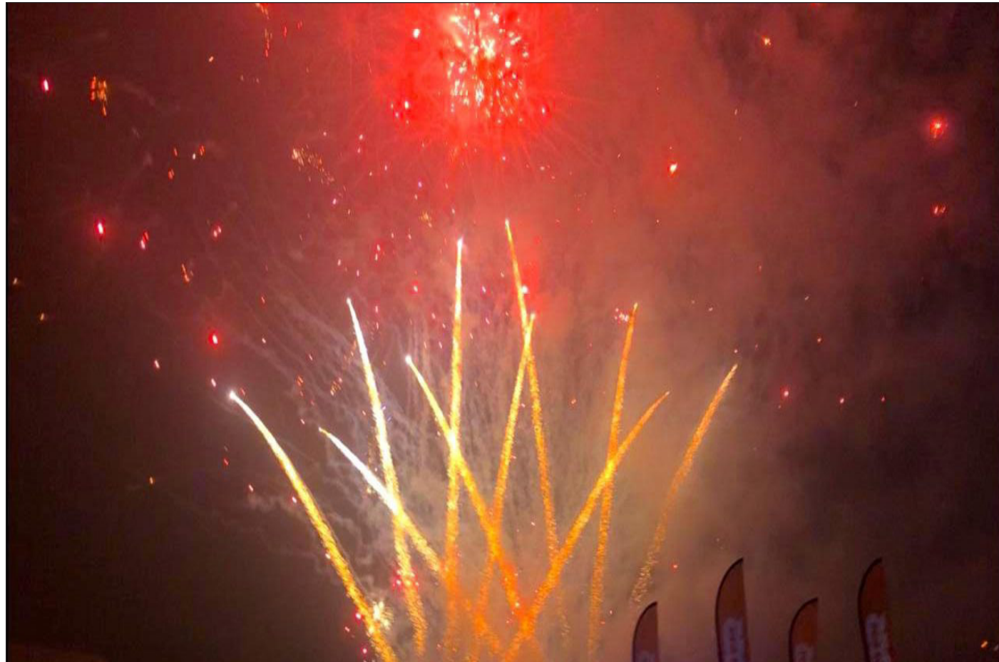
BONFIRE NIGHT: Antisocial behaviour soars as fireworks used against police and fire crews