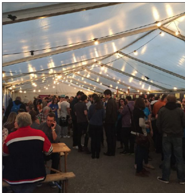
CHEERS: Pints flow at city's beer fest

Last year's event attracted over 6,000 people and 18,000 pints were drunk over the four days.