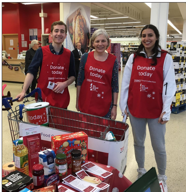
SUPPORT: Our reporters at Tesco

Supporting foodbanks is so important, especially during the winter, and it was a pleasure for On The Don to help out with this great cause.