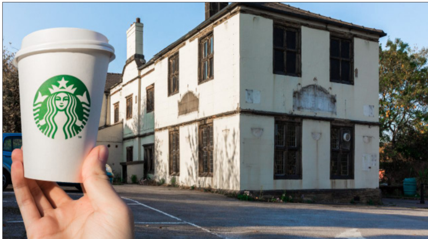
DRIVE-THROUGH: The 17th century building is to receive 21st century additions