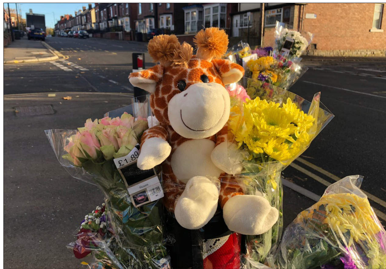
HEARTBROKEN: Tributes left for crash victims