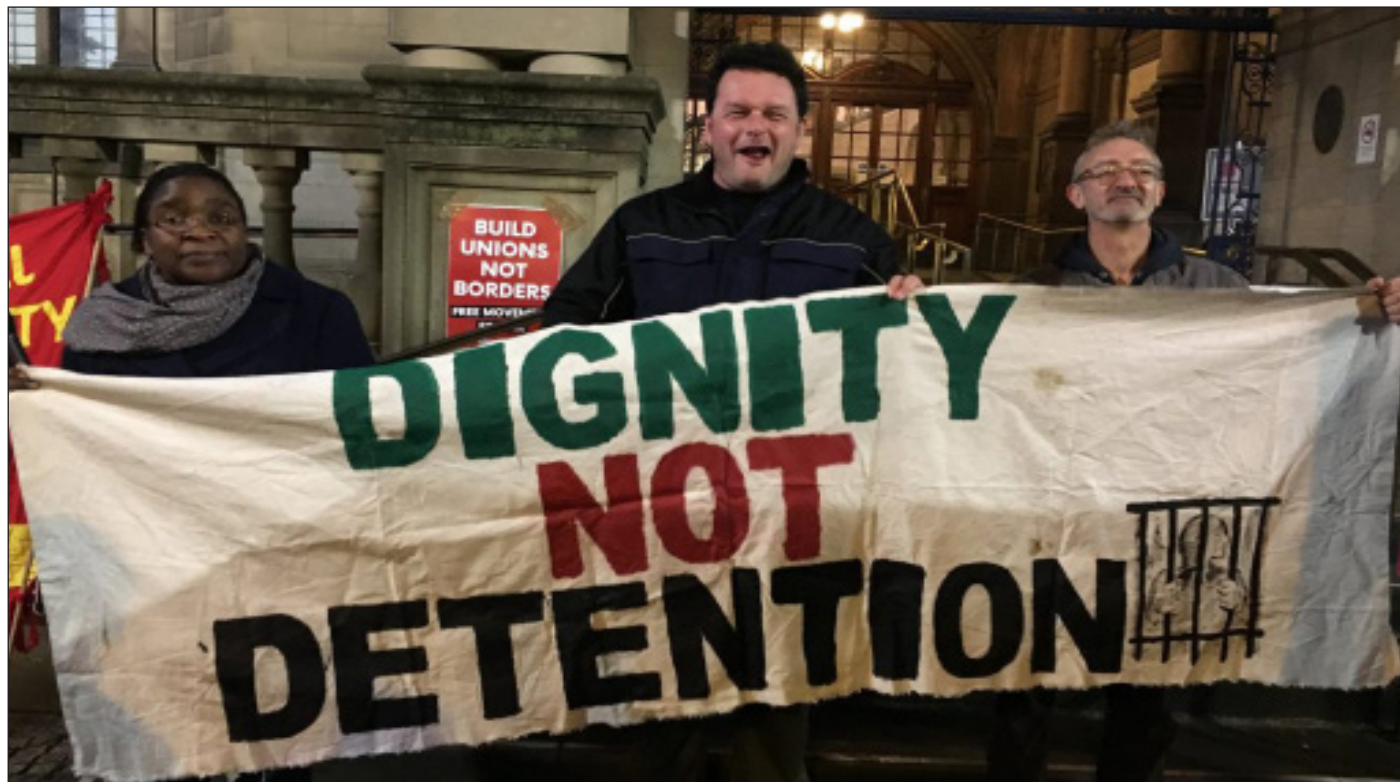
PROTEST: Around 100 campaigners gathered outside Sheffield's Town Hall yesterday

skilled and unskilled labour into the UK has been positive economically and culturally.