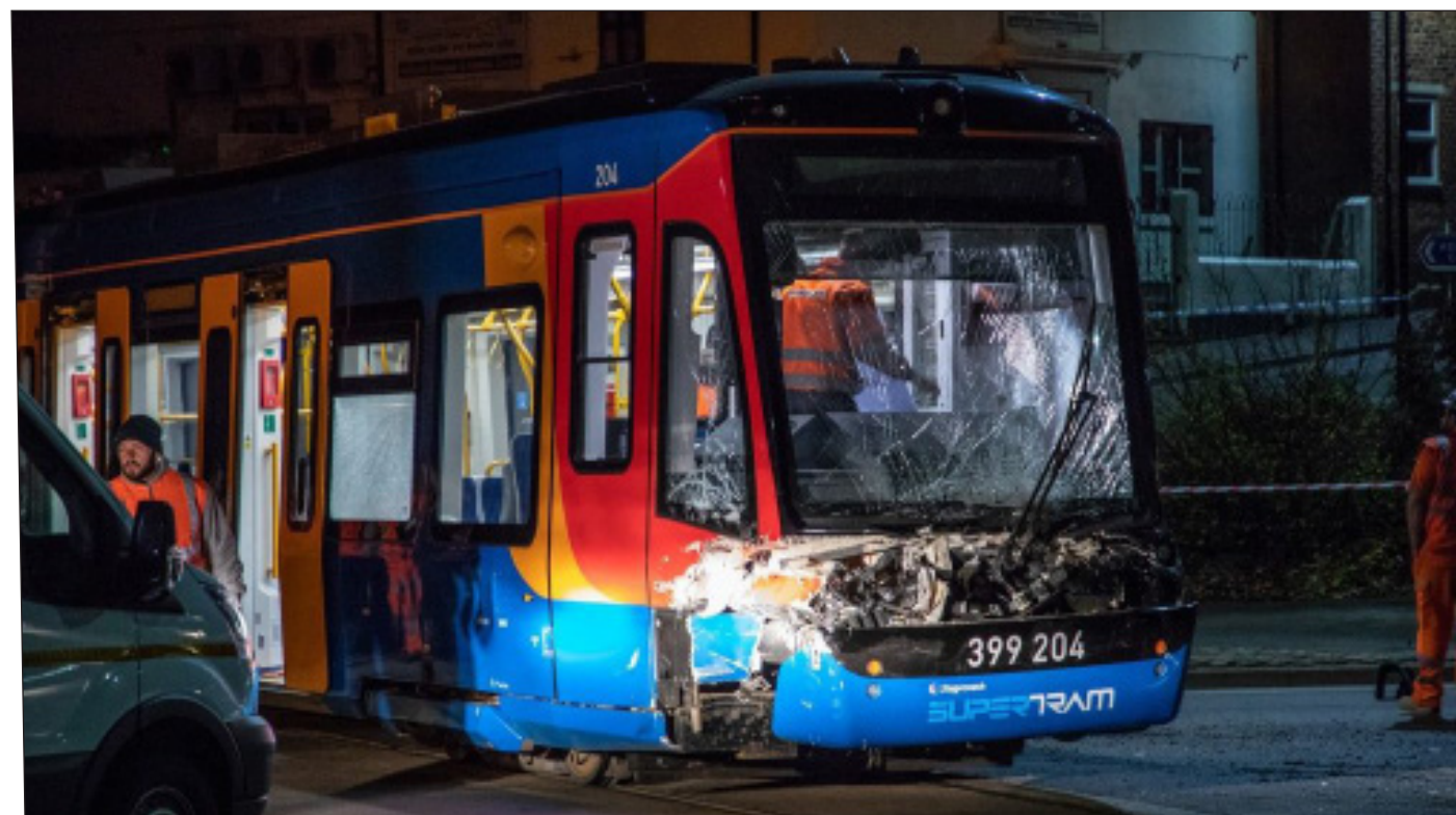
SMASHED: Workers attempt to remove the stricken tram-train from the tracks in Attercliffe

The impact caused the tram to derail and the windows of the driver's cab were