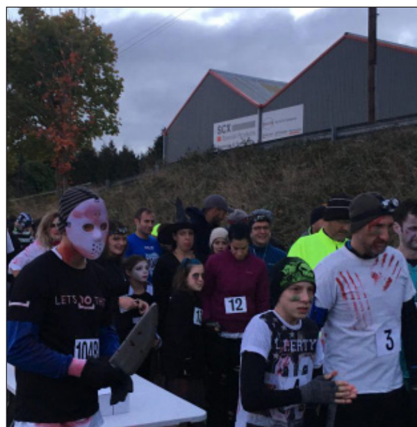
SPOOKY: Runners wearing costumes

DOZENS took part in a zombie apocalypse run for Alzheimer's UK at Meadowhall on Saturday.