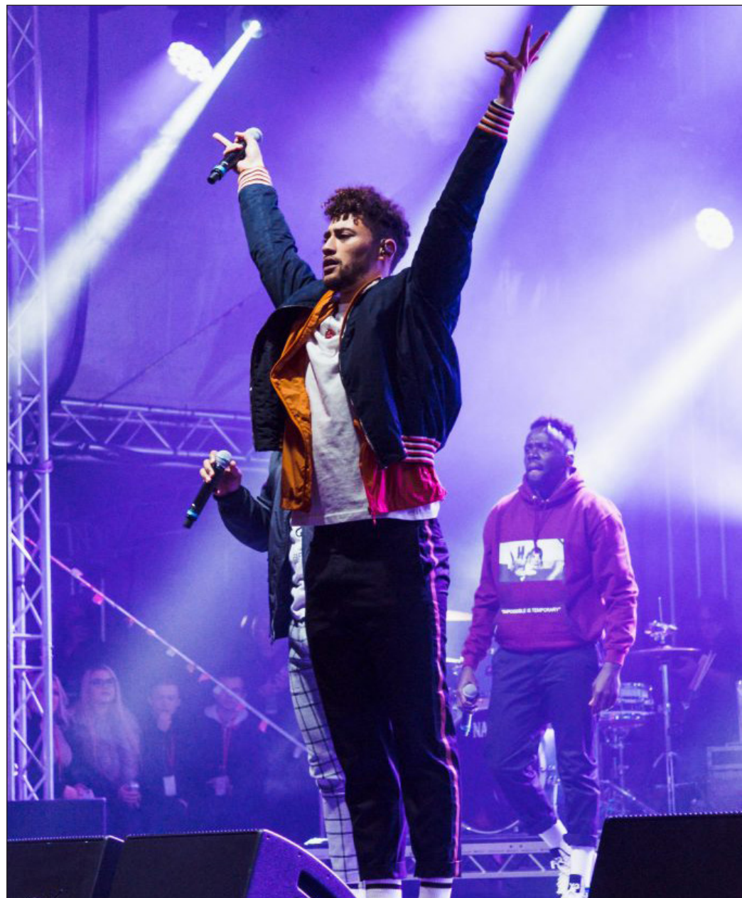
ENCORE: X-Factor winners Rak-Su rock the stage at Meadowhall

Construction of the fish pass should be completed by July next year.