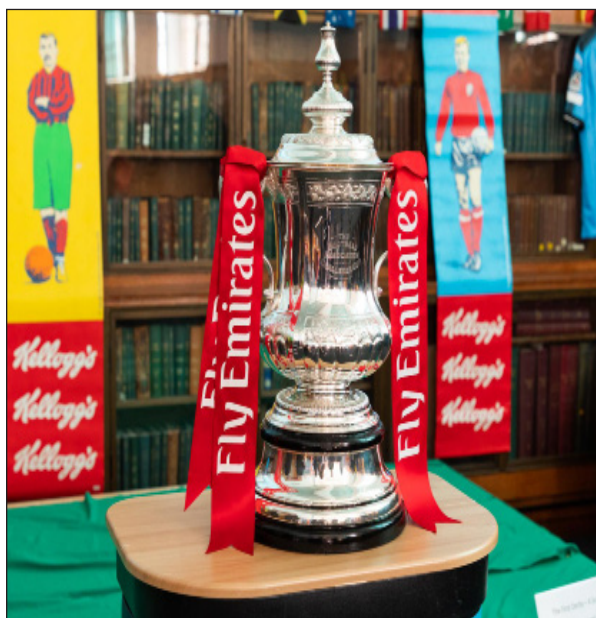
SILVERWARE: The FA Cup on display