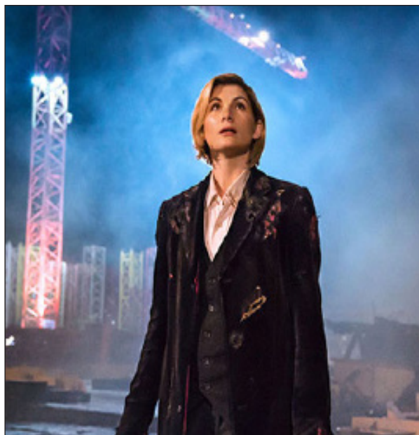
DOCTOR: Jodie Whittaker in Sheffield

Sheffield City Council tweeted: "We're reyt proud that the fabulous new #DoctorWho handmade her all new sonic Swiss army knife with Sheffield steel. What an opening!"