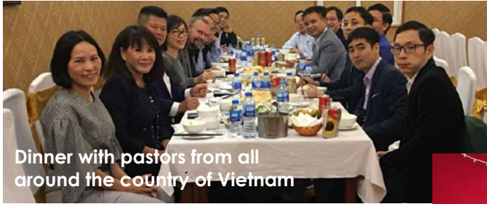
Dinner with pastors from all around the country of Vietnam