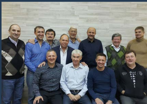
A group of pastors from Kazakhstan who support the ministry of ICEJ